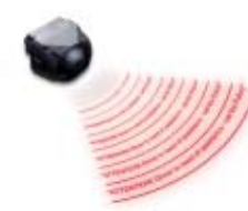
Personal Attack Alarm Repeated synthesised vocal alarm siren operated by dashboard panic button, with hazard flashers, and vocal siren alarm.