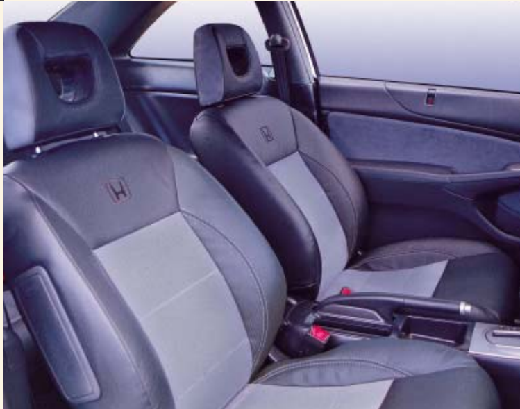
Leather Seats Sports Perforated and Grey Suede Centre Panels Leather seats completely change the feel and look of your car. An option that improves the value of your car as well as your driving experience.