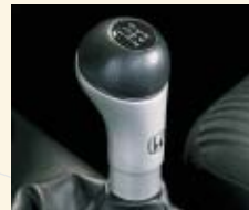
Gear Shift Knob Leather / Silver (MT)