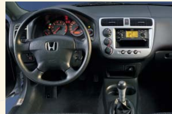
Dash Panel Trim (Champagne Silver) Enhances the aesthetics of your Civic, providing a stylish sporting interior look. (3 piece - Centre Dash & Heating Vents)