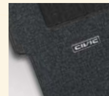
Floor Carpet with Civic Logo.