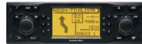
CD Navigation Tuner

The very latest technologically advanced GPS provides voice guidance accompanied by screen displays indicating your next manoeuvre. Mapping is by TeleAtlas®. The system additionally offers a wide range of practical features, such as longitude and latitude positioning, time of arrival, choice of route type, congestion diversion, fastest or shortest route options and inbuilt music CD and RDS radio tuner. (A compact integrated music and navigation system)