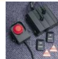
CAT 1 Security Alarm Honda's top of the range, high quality Thatcham approved security system.

Remote, ultrasonic sensors, with additional immobiliser and perimeter protection.