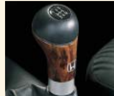
Gear Shift Knob Leather / Wood (MT)