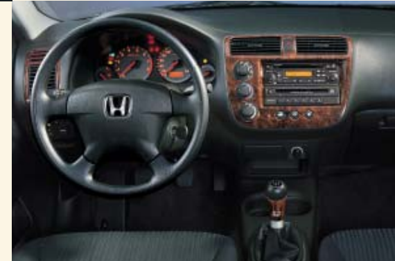
Dash Panel Trims (Wood look) Enhances the aesthetics of your Civic, providing a stylish classic interior look. (3 piece - Centre Dash & Heating Vents)

To maximise your driving pleasure, a range of stylish ergonomically designed options has been carefully selected to enhance your motoring enjoyment as well as allowing you to personalise your vehicle. Whether you want a luxury or sporting feel, these high quality products offer value and aesthetic impact.