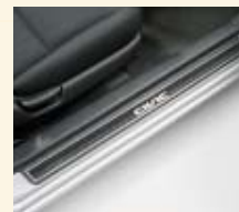
Door Step Garnish Silver with Civic Logo.